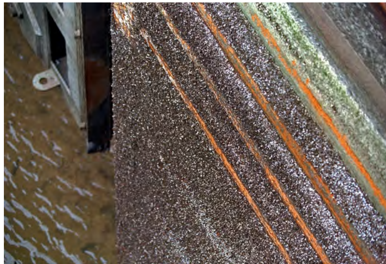
Zebra mussel infestation Ormond Lock.

A fairly well known example is the Zebra mussel, native to parts of southeast Russia. When the zebra mussel was accidentally introduced into foreign waters, it rapidly colonized in many parts of the world to which it was not indigenous, including, among a long list of places, the east of England, and the Great Lakes in the USA;. Anglian Water, a water company in the east of England, has estimated that it spends £500,000 a year clearing these non-indigenous mussels out of water treatment plants. 9 According to the Center for Invasive Species Research at the University of California, the cost of managing the Zebra mussel invasion in the Great Lakes alone exceeds $500 million annually. 10 And the Great Lakes are certainly not the only US waterways affected. This is a substantial amount of money that would not have to be spent had the Zebra mussel not been inadvertently introduced into the USA to begin with. It is reckoned that the introduction to the Great Lakes occurred via ships' ballast water. 11